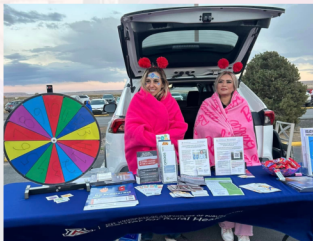
Sponsors of the Trunk of Treat: University of Arizona - Rural Health representatives at the booth

Thank you to Hopi Behavioral Health Services, Hopi Health Care Center and University of Arizona - Rural Health Services for helping with a successful 2024 Red Ribbon Week.