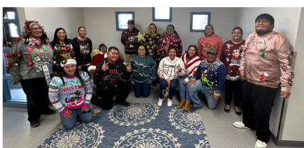
Hopi Foundation Staff 2024 Ugly Sweater exchange at the staff Christmas luncheon