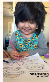
Youth participant colors at Youth Christmas Stocking Craft Event

Event was conducted which included youth, adults and Hopi Foundation staff members to make a stocking for the upcoming holiday. This event was meant to focus on spending time with one another, have a chance to talk amongst each other and have a positive outlet of crafting.